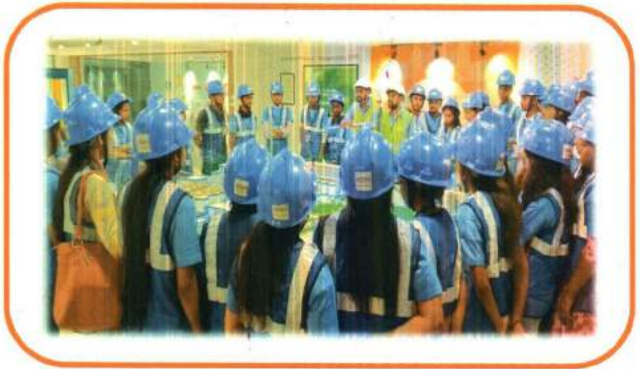
6. Government of Gujarat-Placement Fair at VNSGU, Surat Date:-10/3/20223